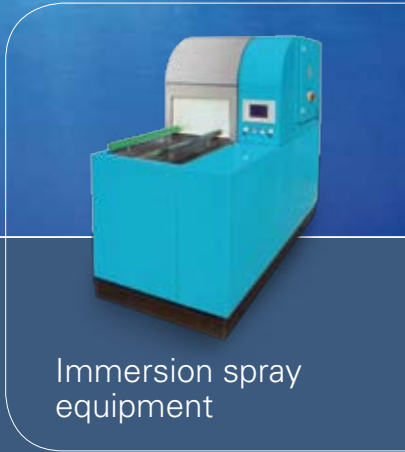
Immersion spray equipment